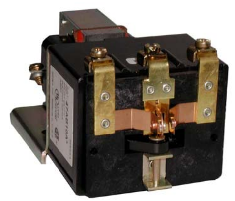
Contacts shown with Plastic cover removed