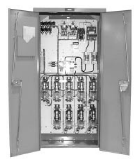
Figure 1: Single-Motor Controller

This bulletin describes Class 6121 DC reversing, plugging controllers, rated for use on 230 Vdc systems. Use these controllers with DC series wound motors on crane bridge and trolley drives.